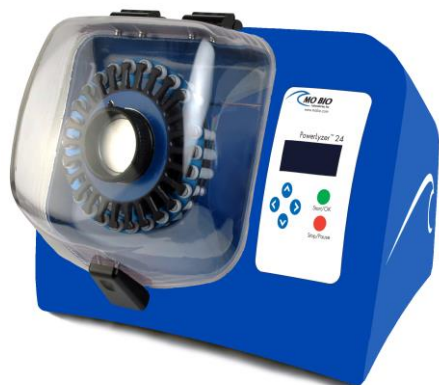
PowerLyzer ® 24 Bench Top Bead-Based Homogenizer Catalog# 13155 ( www.mobio.com/powerlyzer )

The PowerLyzer ® 24 is a highly efficient bead beating system that allows for optimal RNA extraction from a variety of plant and animal tissues. The instrument's velocity and proprietary motion combine to provide the fastest homogenization time possible, minimizing the time spent processing samples. The programmable display allows for hands-free, walk-away extraction with up to ten cycles of bead beating for as long as 5 minutes per cycle. This kit provides Ceramic Bead Tubes prefilled with 2.8 mm beads for homogenizing plant tissue for optimal RNA isolation. Alternative pre-filled bead tube options are available for additional applications. Please contact technical service ( technical@mobio.com ) for details.