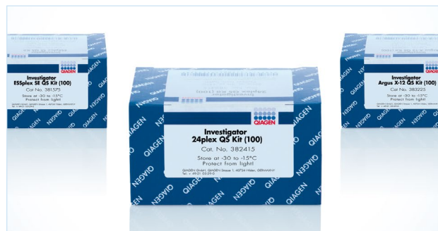
Figure 1. Investigator STR Assays containing the unique Quality Sensor.