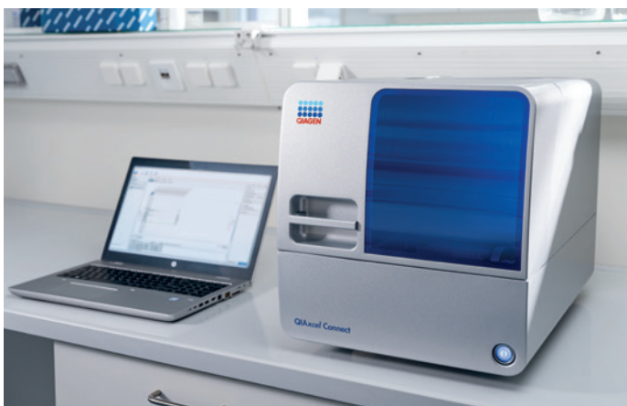
Figure 1. QIAxcel Connect System

An increasing number of laboratories are using electronic records (ER) and electronic signatures (ES) for exchanging and storing data. Electronic documentation offers many benefits, including increased efficiency and productivity when storing data and easier information sharing and data mining. If a company or laboratory intends to use an electronic format instead of paper for records that are required under FDA regulations and requirements, the company or laboratory must comply with the regulations issued by the FDA: Final Rule 21 CFR Part 11 Electronic Records . ▶