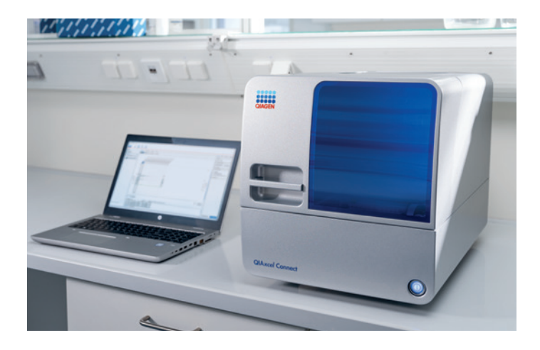
Figure 1. QIAxcel Connect System

An increasing number of laboratories are using electronic records (ER) and electronic signatures (ES) for exchanging and storing data. Electronic documentation offers many benefits, including increased efficiency and productivity when storing data and easier information sharing and data mining. If a company or laboratory intends to use an electronic format instead of paper for records that are required under FDA regulations and requirements, the company or laboratory must comply with the regulations issued by the FDA: Final Rule 21 CFR Part 11 Electronic Records.